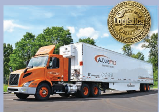
A Proud "Quest For Quality" Recipient Since 1989