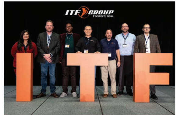
ITF Group Shares 10 Years in Business with Customers and Staff.

Between our trusted carriers and our very own fleet, we keep your shipments moving—no matter where they’re going or when they need to be there. Stay on track and on time.